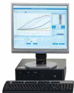
RTCA HT Control Unit