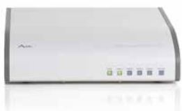
RTCA HT Analyzer